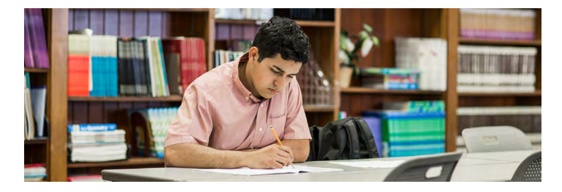
* 2023 Summer Learning Center term dates are: June 5 to July 21, 2023