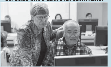
Completing five to seven computer courses can eam you a certificate in one of the following programs: